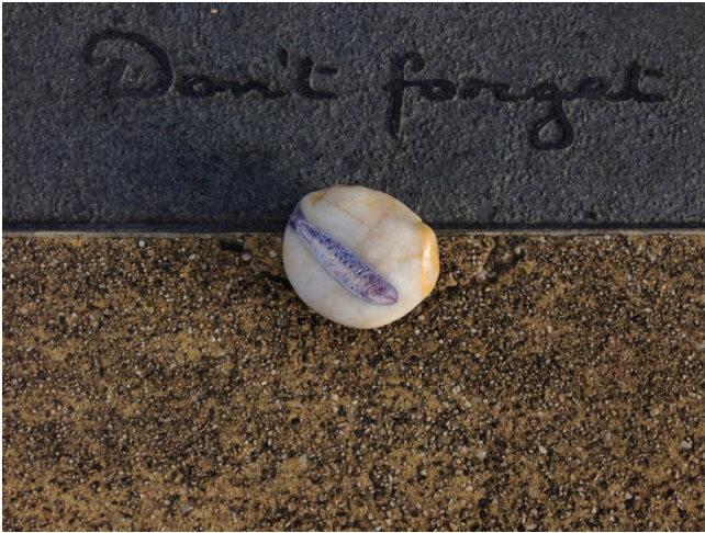
Imbloc, Port Melbourne, 2 August 2014

Fish out of Water – Murray Cod is a development from an intervention project that began at summer solstice, 2013 and continued through summer solstice 2014. I have been painting a lone sardine on a river pebble – the sardine is a reference to the waters near Sardegna and the Port of Napoli – the port where my parents began their journey to Australia. I then released a pebble at each of the eight sabbats. These represent the earth changes of the summer and winter solstice, the equinoxes and the four cross quarters of Lammás, Samhain, Imbolc and Beltane. Often associated with pagan festivals, I am acknowledging this history as well as connecting with the earth changes through out the year; the seasons, light and my own connection to place.