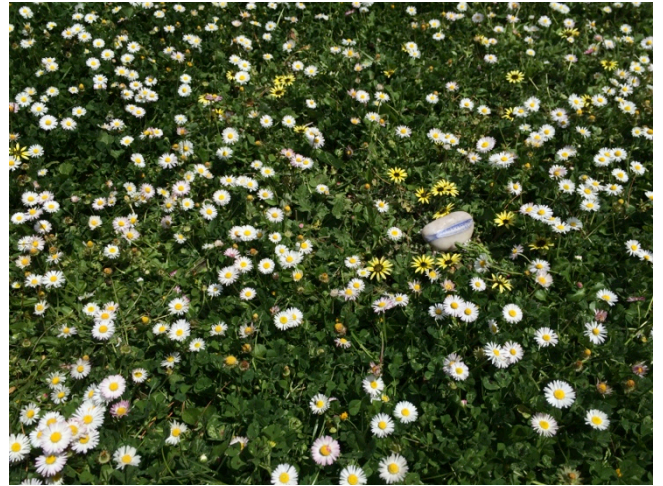
Beltane, Monsalvat, 31 October 2014

The first fish was released on summer solstice, 21 December 2013 at Elwood Beach. It was released at the edge of the breaking waves and then left behind to be either, swallowed by the sea or picked up by a beachcomber. The second was released at the Greco Roman columns near the Old Exhibition Buildings on Lammás, 1 February 2014, this was a reference to my Italian heritage. The sixth release was at Station Pier, Port Melbourne on Imbloc, 2 August 2014, this is where my parents arrived in Australia. There have been nine releases in total and the final fish in this cycle was released on the summer solstice, 21 December 2014. This project has been extended into a nine year project, Fish out of Water – Summer Solstice where I will release a sardine painted pebble at the summer solstice for each year ending 21 December 2021.