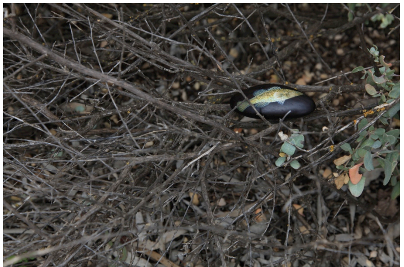
Fish out of Water – Murray Cod, Lyrup Flats South Australia, 2015

E: art@filomenacoppola.com W: filomenacoppola.com